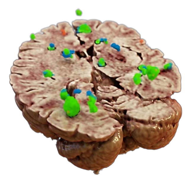
3D cut of a structural brain image showing multiple sclerosis lesions

Department of Biomedical Engineering Gewerbestrasse 14 CH – 4123 Allschwil +41 61 207 54 02 news-dbe@unibas.ch www.dbe.unibas.ch